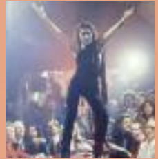
Warhol and Beuys