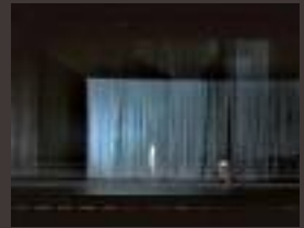
Ruses - Fragments of a Lost Story Royal Opera House April 2008

VENUE: Summerhall DATES: 15th December 2012 - 22nd February 2013 TICKET PRICE: Free Entry