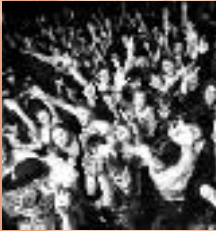
Hogmanay at Summerhall